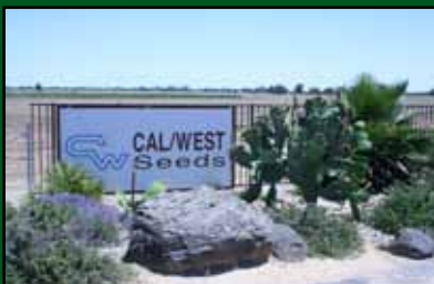
Cal/West Headquarters - Woodland, CA