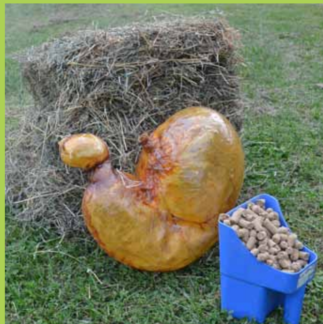
Figure 2. Model of the stomach from a mature horse next to 10 lbs of hay and 3 lbs of concentrate. The small inelastic stomach of the horse is poorly suited to consuming a meal of this size at one time.

Compare the size of a horse’s stomach (Figure 2) to the volume of 10 lbs of hay and 3 lbs of concentrate – it is easy to see why horses should be allowed access to forage throughout the day. Food passes relatively rapidly through the stomach and then enters the small intestine, the site of enzymatic digestion of protein, carbohydrates, and fats. While some forage components will be digested in the small intestine, it is a more important site for digestion of nutrients found in concentrates. In grain-based concentrates, starch is the major source of calories. Ideally, any starch consumed by horses will be digested in the