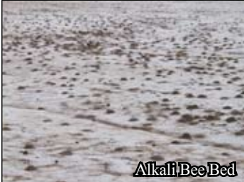
Alkali Bee Bed