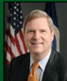
Secretary Tom Vilsack