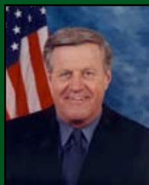
Congressman Collin Peterson