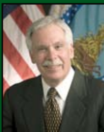
Secretary Ed Schafer

Visit the NAFA website to view the archived articles - www.alfalfa-forage.org