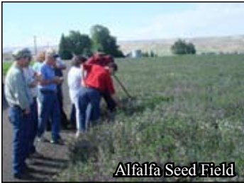
Alfalfa Seed Field